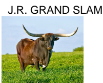
J.R. GRAND SLAM