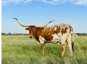
CO Butterscotch 534