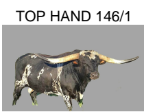
TOP HAND 146/1