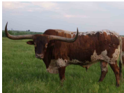
JP GRAND RICHY