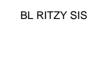
BL RITZY SIS